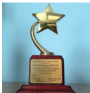
CASA’s Foundation Investor Award August 22, 2013