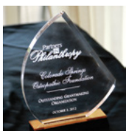
Partners in Philanthropy Outstanding Grant Making Organization October 3, 2012