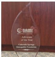
National Alliance on Mental Illness-C.S. (NAMI) 2016 Advocate of the Year May 4, 2017

WHO WE ARE: Established in 1984, Colorado Springs Osteopathic Foundation’s charitable mission lives on today through grant and scholarship awards, as well as collaboration with like-minded organizations to address community health issues. Learn more about our history and view a video of our region’s osteopathic legacy at our website, csof.org .