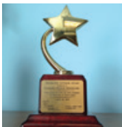
CASA's Foundation Investor Award August 22, 2013