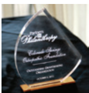
Partners in Philanthropy Outstanding Grant Making Organization October 3, 2012