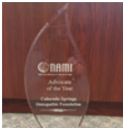
National Alliance on Mental Illness-C.S. (NAMI) 2016 Advocate of the Year May 4, 2017

WHO WE ARE: Established in 1984, Colorado Springs Osteopathic Foundation's charitable mission lives on today through grant and scholarship awards, as well as collaboration with like-minded organizations to address community health issues. Learn more about our history and view a video of our region's osteopathic legacy at our website, csof.org .